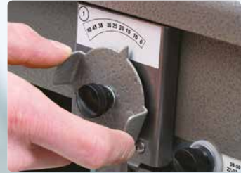
Simple dial adjustments to change from a 6 mm to a 50 mm coil.